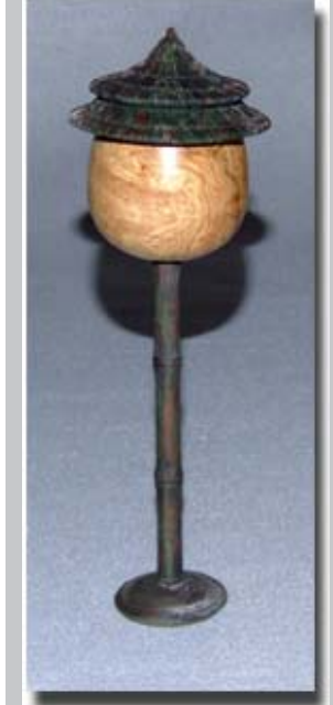
Jan Garlington Lidded pedestal box, Maple with pyrography textured lid.