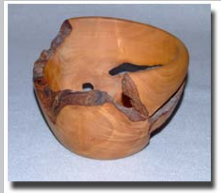
Jack Northey Maple/turner oil