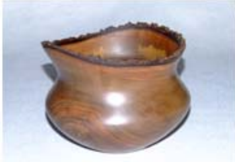
Black walnut/Danish oil Rick Erb