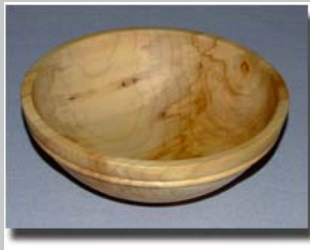
Maple 10 x 5