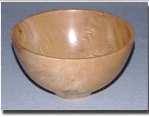
Maple 6 x 9 1/2 Buffed & waxed

Note: This piece was actually turned oval on a special eccentric chuck. Perhaps we can get Mike to demo this at a future meeting?