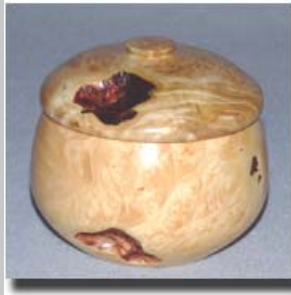
Maple/Profin 5 x 5