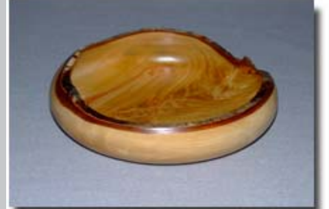
Birch 3 x 10