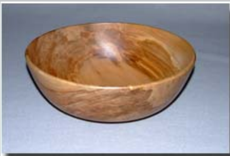
Maple 6 x 13/walnut oil