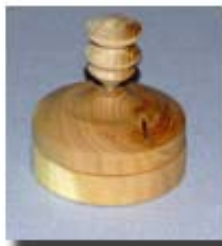
Locust/ Tried & True