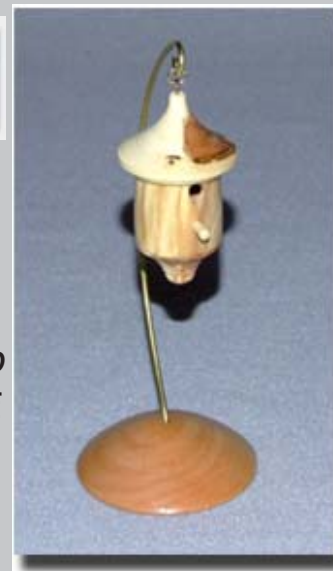
Birdhouse: Camealua with maple base

Mark's testimonial for the wisdom of wearing a face shield! This chip is about 3" long 1 1/2" wide and 3/8" thick.