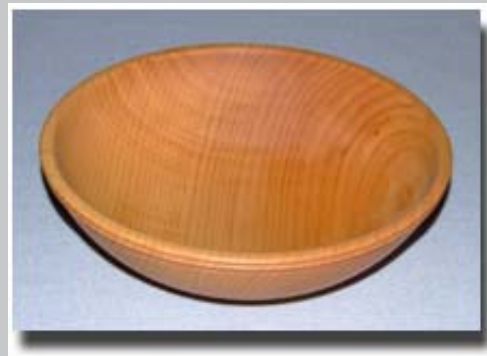
Maple/walnut oil 14 x 5