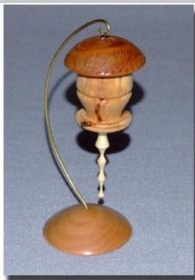
Scrap wood birdhouse - note: stand by Mark Straight