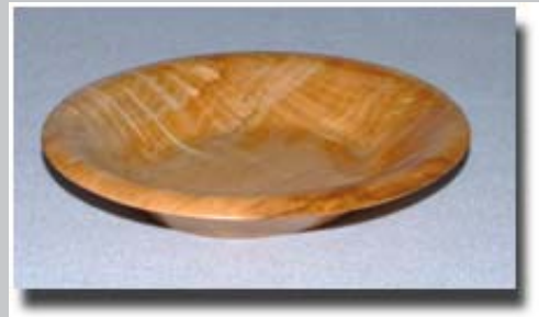
Maple/Profin 9 1/2 x 8 x 1 1/2

Note: This piece was actually turned oval on a special eccentric chuck. Perhaps we can get Mike to demo this at a future meeting?