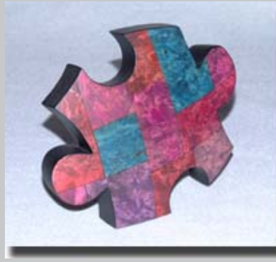
Maple burl 7 x 6 1/2