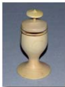
Madrone/Tried & True