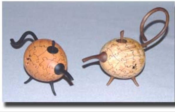
Maple burl & walnut compwood 9 x 6 x 3 1/2 Polyurethane