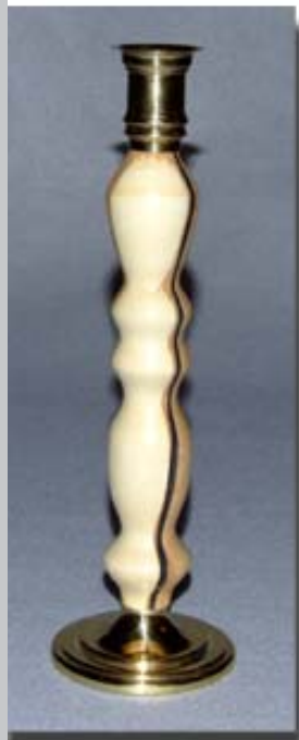
Lilac/Tried & True