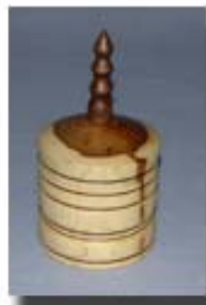
(?)/Tried & True