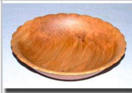
Maple/walnut oil 14 x 4 "First bowl I have done any carving on"