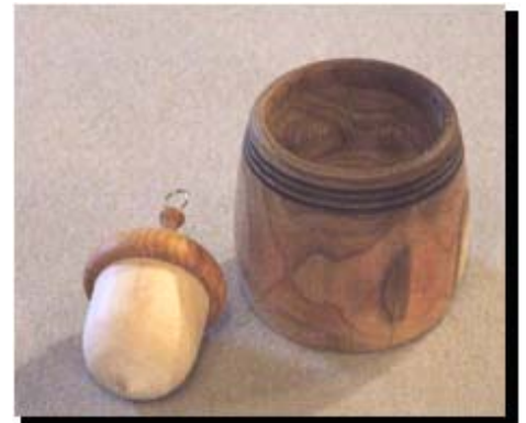
Two small pieces done at the last Deming turner's campout. Acorn has a yew wood cap & maple nut. Small unlidded box is also yew wood.