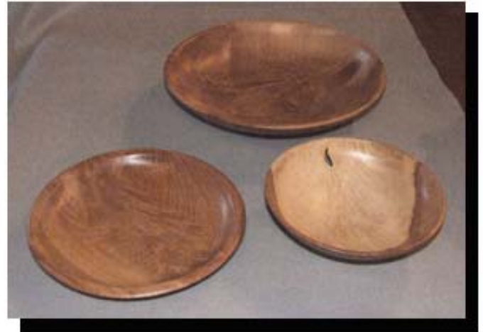
Dick Jacobsen (right) Feathered maple 8", 10" & 14". Profin