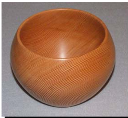
Old growth Douglas Fir; beeswax. 6" x 6" We don't see much fir in our gallery. Chick provided an example of how great this wood can be for simple elegant forms.