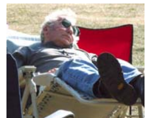
Evenings were, in a word, relaxing.