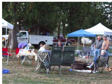
Deming Turner's Camp