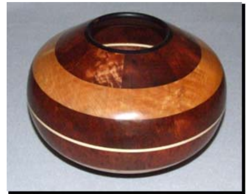
Hollow form jar: Redwood burl w/ebony rim accent. 9" x 7". Profin