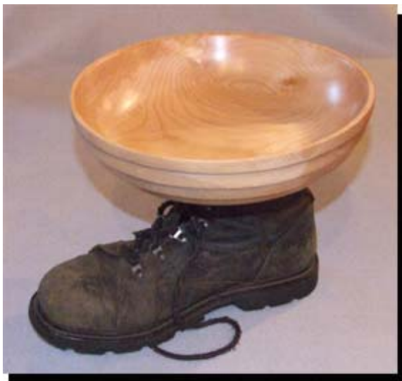
Big leaf maple. 10" x 4", beeswax Chick wanted to avoid any chance of criticism for not having a foot on his bowl!