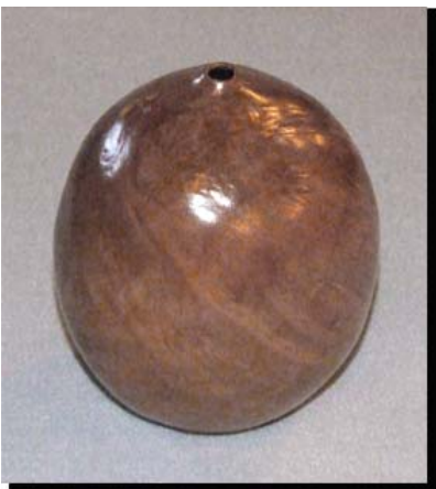
Madrona Pod Lacquer