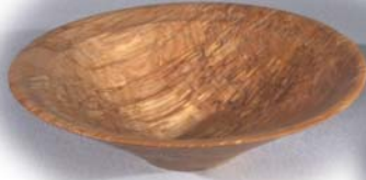
Maple Shellac 11" x 4"