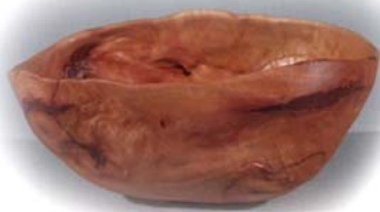
Madrone Profin 12" x 8" "Green when turned"