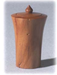
Bill Cowen Cherry Toothpick Holder Oil 2" dia x 4" tall "Fun Project"