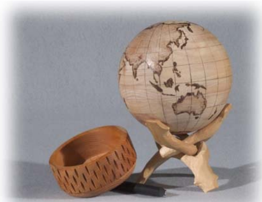
Yew No Finish 1½" x 3½" "From a Rose Engine" Globe & Stand