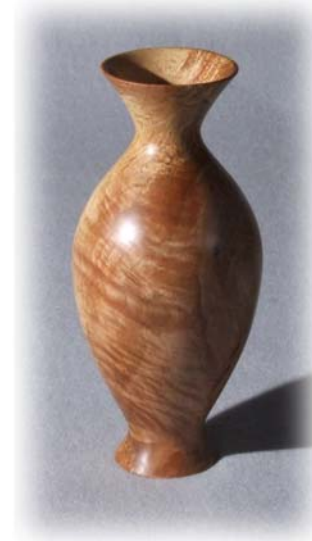
Maple Profin 3" x 8"