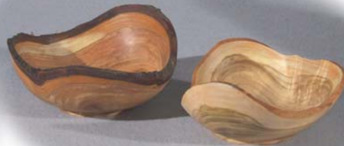
Cherry - Unfinished