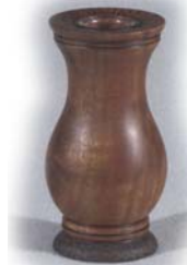
Walnut Walnut Oil "Old piece reworked with branding"