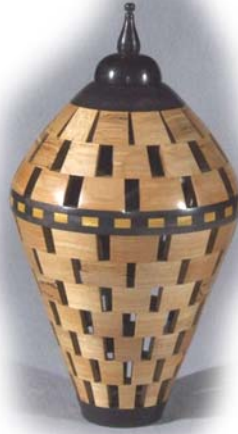
Maple, Yellow Heart, Ebony Spray on Poly 6½" x 12½" tall "196 pieces; first segmented bowl"