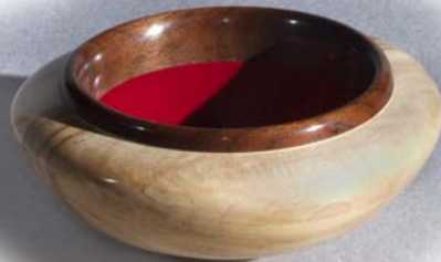
Chestnut, Walnut & Glass Oil & Wax 6" x 2½"

Note: These pieces are each over 24" tall!