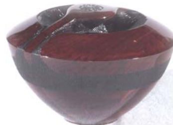
Ron Whede Maple Arm-R-Seal "Carved, dyed with pyrography outside and inside"