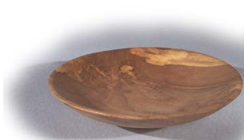
Maple Danish Oil