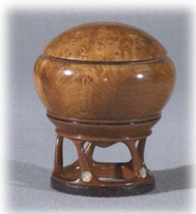
Ron Means Maple & Cherry Shellac 3" x 4" tall