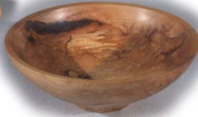
Maple Shellac & Wax 13" x 5"