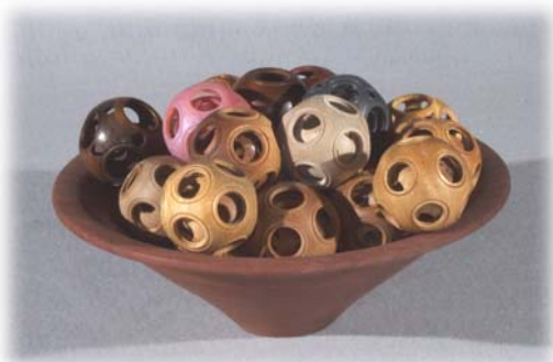
Fred Holder Various Woods Oil 2 1/2" Diameter Chinese Balls