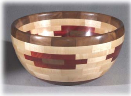
Coty Howe Lyptus, Maple, Bloodwood, Walnut Profin Finish 13" x 8" First total segmented bowl!