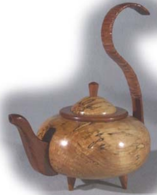
Spalted Maple & Cherry Wipe on Poly 9½" w x 11" tall "First teapot!"