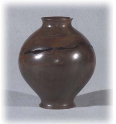
English Walnut Profin 4" x 6"