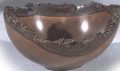
Walnut Oil & Wax 7" x 3"