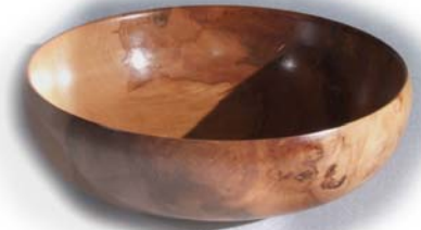
Mark Straight Apple Shellac 14" x 4"