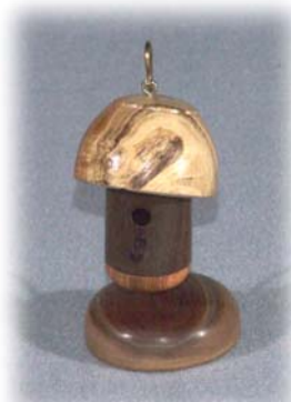
John Gruenwald Birdhouse: Walnut house w/ Honey Locust Roof 1½" x 2½"