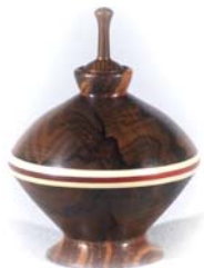
Bacoti, Zebra, Rosewood & Holly Profin 3" x 3" "Perfume Bottle"