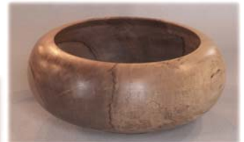
Myrtle Poly 15" diameter