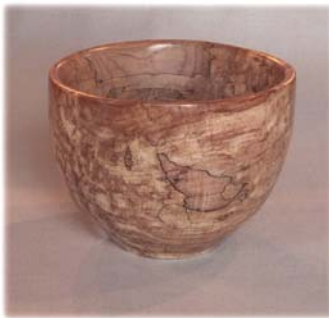
Maple Spalted & Figured Beeswax 9" x 6"