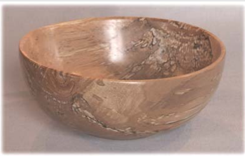
Maple Spalted & Figured Beeswax 13" x 4"