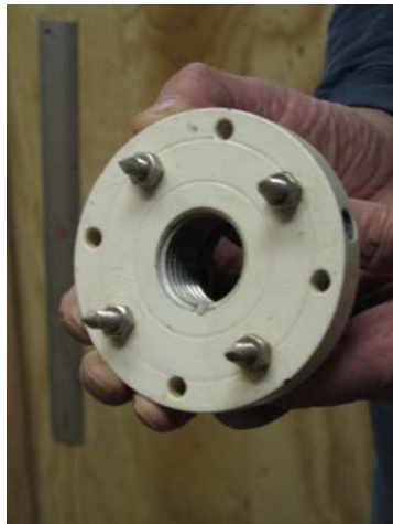
Steve's face plate spur drive!

A few pieces that illustrate Steve's obsession with detail and craftsmanship.