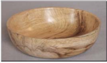
Silver Maple Wipe on Poly 10" x 3"