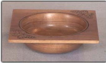
Cherry Wipe on Poly