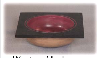
Western Maple Aniline Dye, Shellac, Wipe on Poly