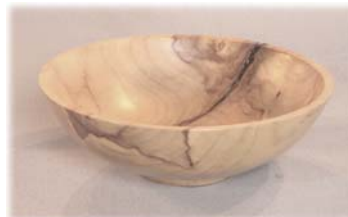
Silver Maple Poly