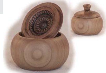
Melanie Mankamyer Plum w/Wax finish 3" x 3" Melanie calls this a "salt pig".