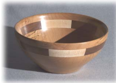
Coty Howe Maple & Walnut Segmented Profin 6" x 10"