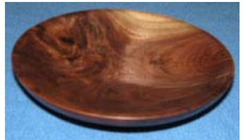
Walnut dish 9.5" dia by Dave Blair