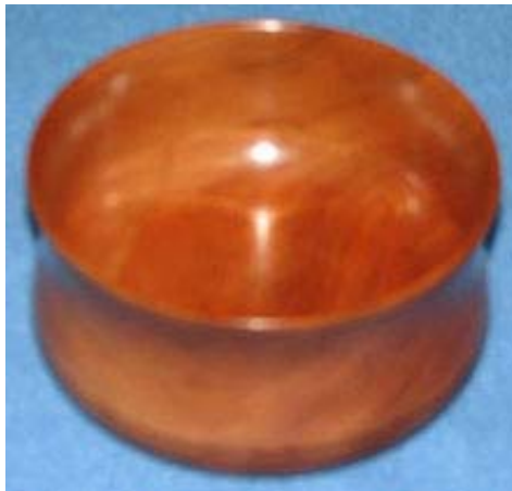
Cherry bowl 5” dia by Jim Corby