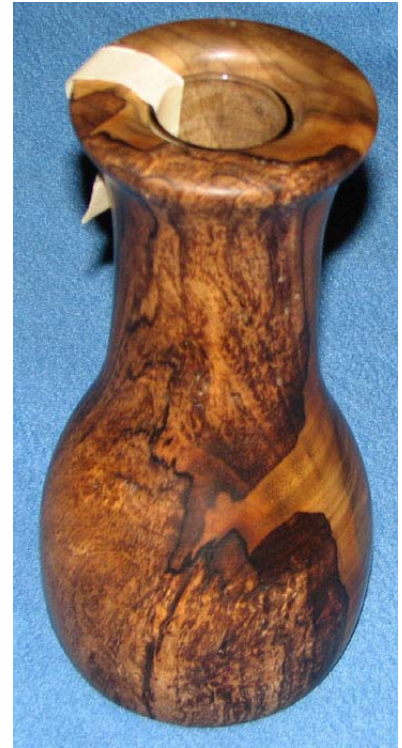
Myrtlewood vase 9.5” tall by Jim Corby