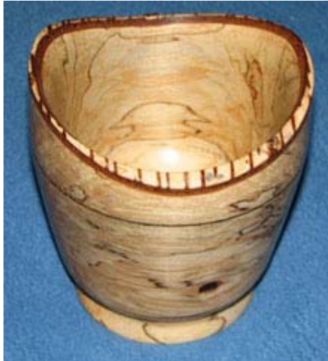
Spalted Birch natural edge vessel 5” dia by Jim Corby