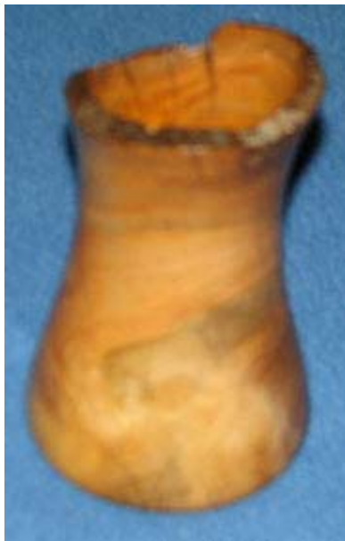
Maple vase 5.5" tall by Bob Elkins