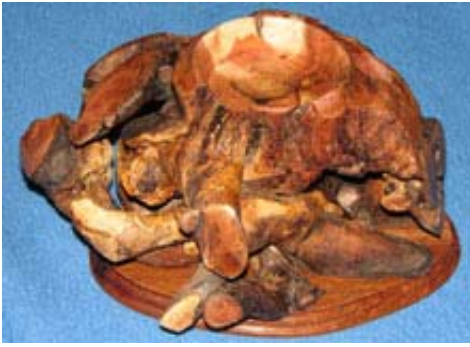
“Cherry” root ball candle holder 10 x7” by Jim Corby