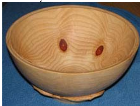
Madrone bowl w/carved bottom 13" dia by Jim Short